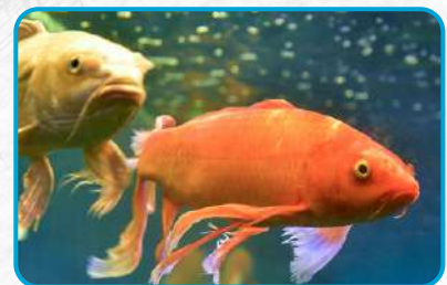
UDAIPUR FISH AQUARIUM