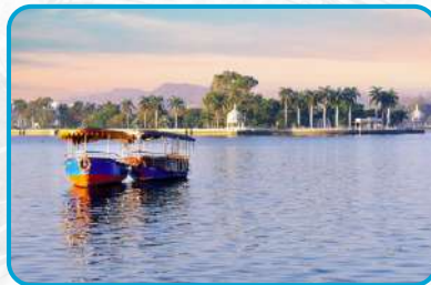
FATEH SAGAR LAKE