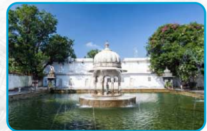
SAHELIYON KI BARI